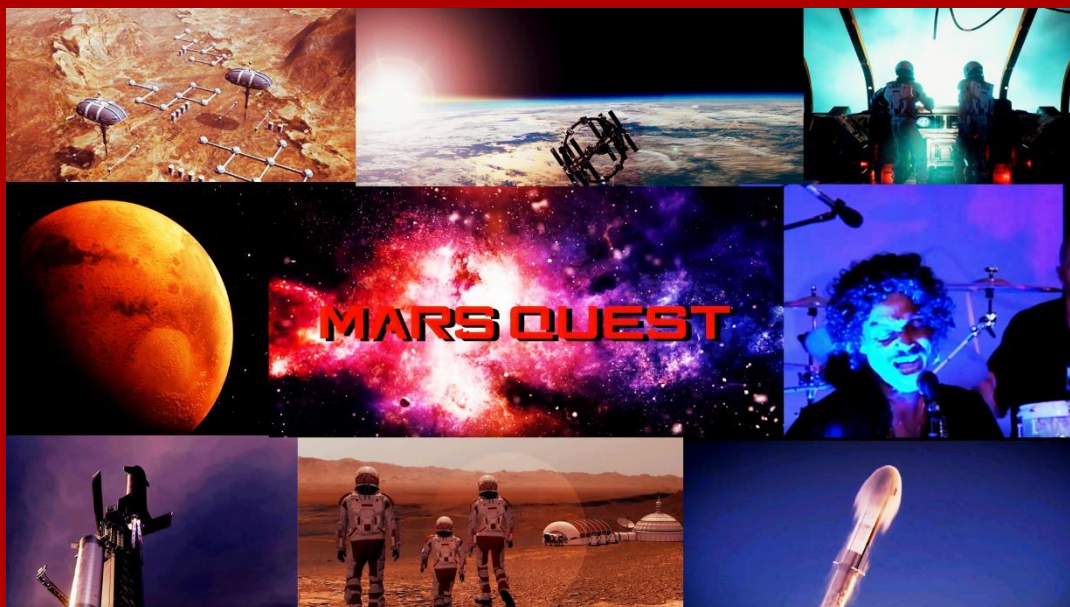
Figure 2- Click on image to view movie trailer

The mission of the "MARS QUEST" indie film is to carry the viewer from the beginning of human's interest in space via Galileo, through to the beginning of the space age and humankind's quest and venture into the far realms of outer-space. The Moon landing as well as knowledge regarding the international space station are covered, then on to the red planet Mars. Elon Musk says " We should be a two planet species because it only being a matter of time before a cosmic extinction event occurs " which by the way the Earth was destroyed the first time by an asteroid which collided with Earth and obliterated the dinosaur population according to science. Global warming is also an impending threat to us earth humans as we have let things get out of hand, due to our greed and uncaring for the environment and Mother Nature!